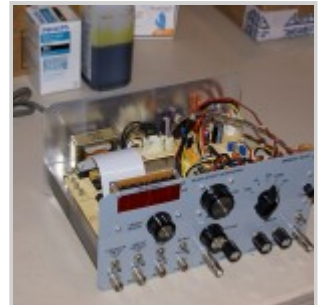
Gary's AFG with the top cover removed.