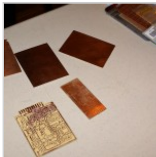
Examples of copper plated PCB stock and exposed/processed PCBs.