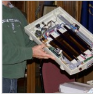
Gary modified an old flatbed scanner he got from W8RA to make an ultraviolet light exposure table.