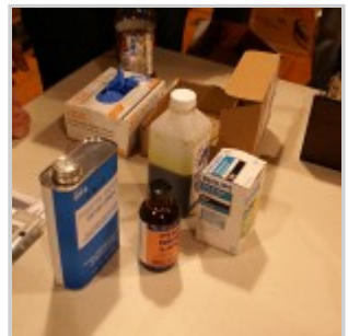
Some of the chemistry used to make printed circuit boards at home.