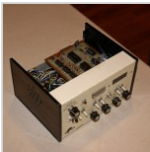
Bob's CB radio based 10m rig with top cover removed.