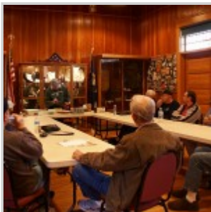
SLAARC members gathered at the Witch's Hat Depot in S. Lyon for the monthly meeting and program.