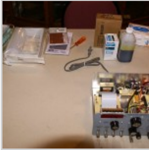
Gary's AFG with some of the materials and supplies used to make printed circuit boards.