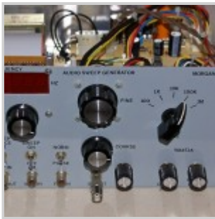
Front panel of Gary's Audio Frequency Generator.