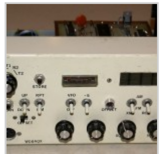
The front panel of Bob's 10m CB based rig.